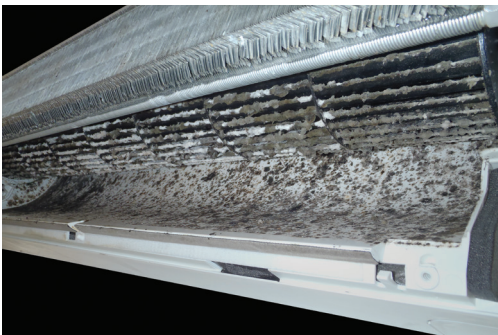
Mold thrives on mini-split blower wheels