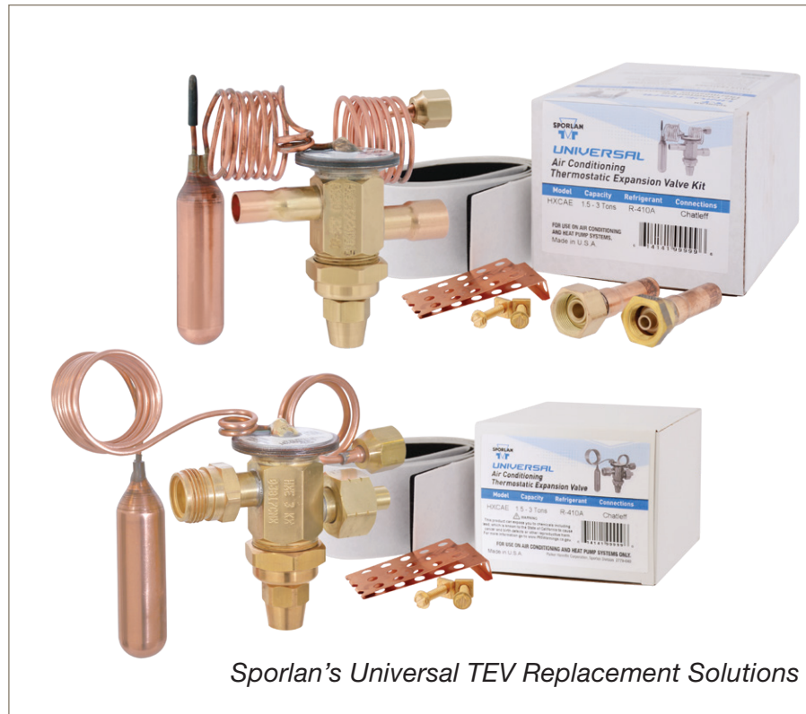
Sporlan's Universal TEV Replacement Solutions

Each valve comes with a 30" long capillary tube equalizer with flare nut. The single pushrod balanced port design ensures precise pin/port alignment, maintaining superior superheat control at wide load conditions.