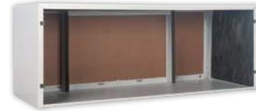
Deep wall sleeve extension PDXWSEXT18 shown with weather panel in place

One-piece, extended wall sleeve with built-in baffle for walls from 13 1/4" to 25 1/2" deep are available by special order.