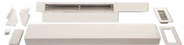
PDXDAA and PDXDEA ship together