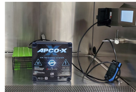
APCO-X™ in test chamber