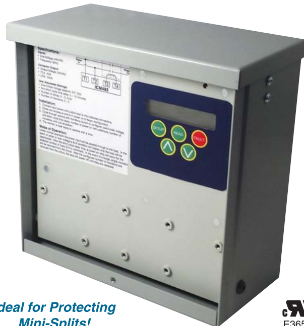
Ideal for Protecting Mini-Splits!